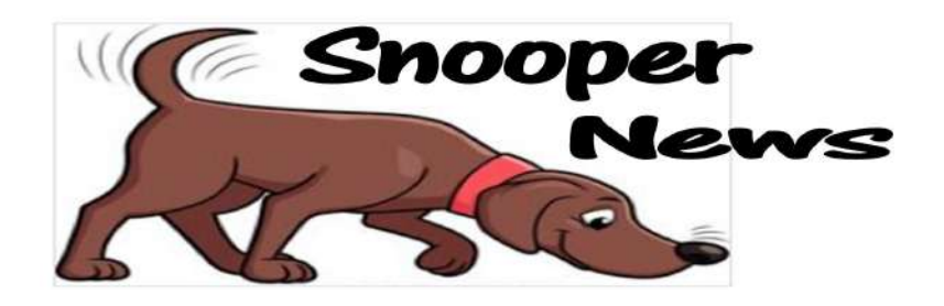
Wednesday June 19th, 2024

See our Welcome Table. There is a book exchange. Free Toys for your Pets. Lost and Found and free Pot Luck Trays. Tomorrow is the last morning to get fresh homemade doughnuts.