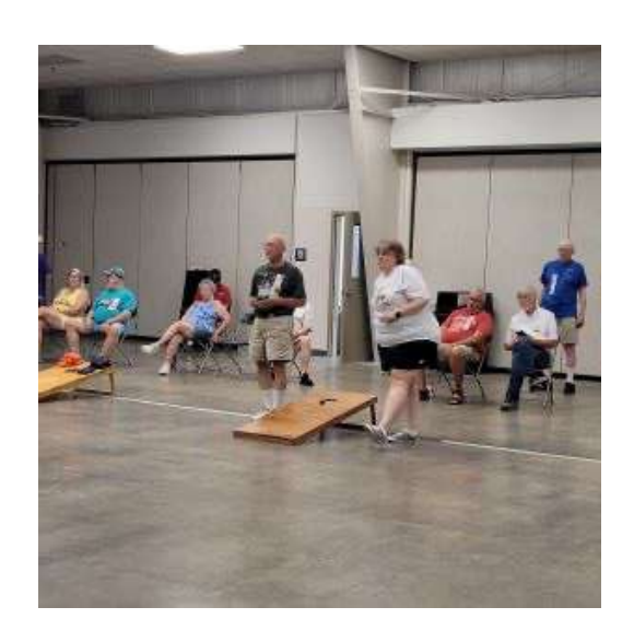
Game on Tuesday was Bean Bag Toss. Winners will be announced on Thursday at the meeting.