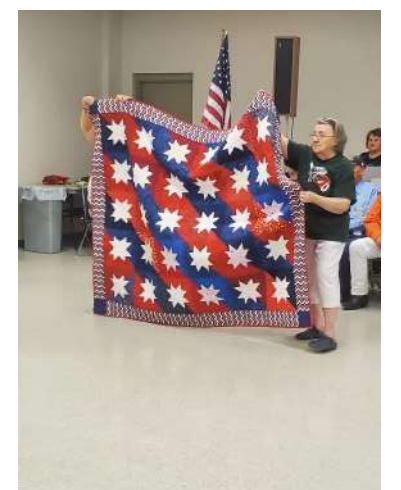
One more quilt